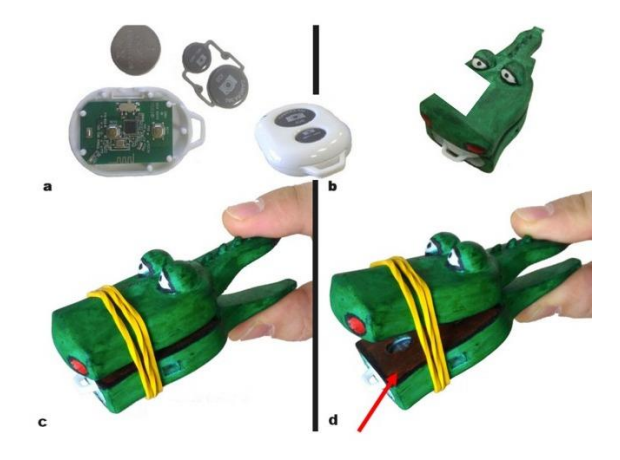
Fig. 2 – Prototype of a pressure sensor for children hand rehabilitation [8].

As a last example, we have a prototype developed for the pediatrics area to help with hand rehabilitation and telemonitoring through smart toys. The hardware used to capture, digitize and transmit (wirelessly) samples of pressure measurements in real time to a mobile device is inside a toy. When squeezing the toy, the sensors send data from the pressure exerted to the operating system of smartphones and tablets. Such devices allow families to receive support to carry out the rehabilitation of their children. Whenever the exercise finishes running, the data is transmitted to a server which, in turn, processes the data to compute the results and show them to the doctors [8].